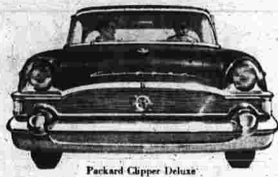
Packard Clipper Deluxe

Pay as little for big car luxury as you'd pay for many low-priced models! Ask for our deal today!