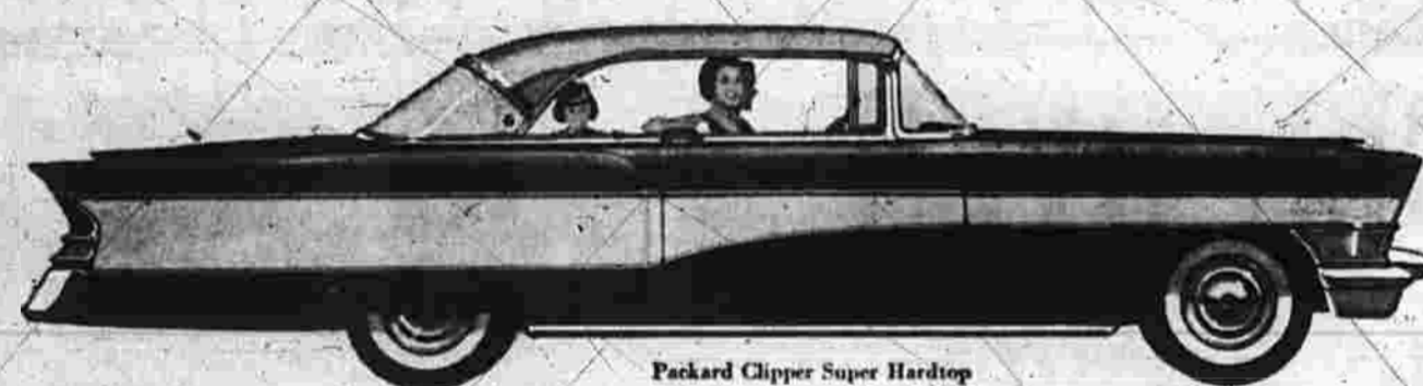
Packard Clipper Super Hardtop

generous trade-in allowances in town! What's more, you get the car with the greatest resale value of all medium-priced cars!